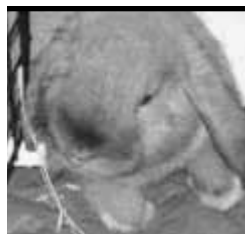
Damon is an fun, active young Lop boy.