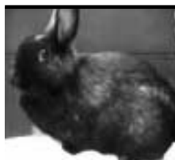
Velvet is a female rabbit who is very loving and playful.