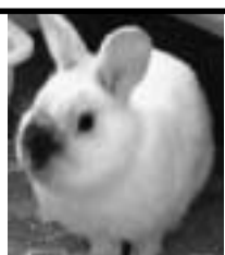
Elderberry is a boy who enjoys exploring his surroundings. He loves to be petted on the nose.