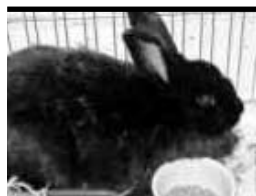
Beatrix is a fun-loving, easygoing bunny who loves to spend time with her human friends.