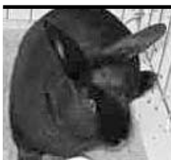
Zorro is a young boy who loves to be petted. He is very friendly, extremely curious about everything, and too busy to be held for long!