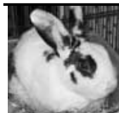
Lotto is a quiet, mature boy who like to be petted. He is curious, but cautious.