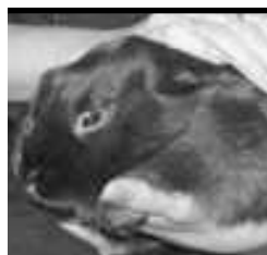
Pierre is an energetic and curious young male.