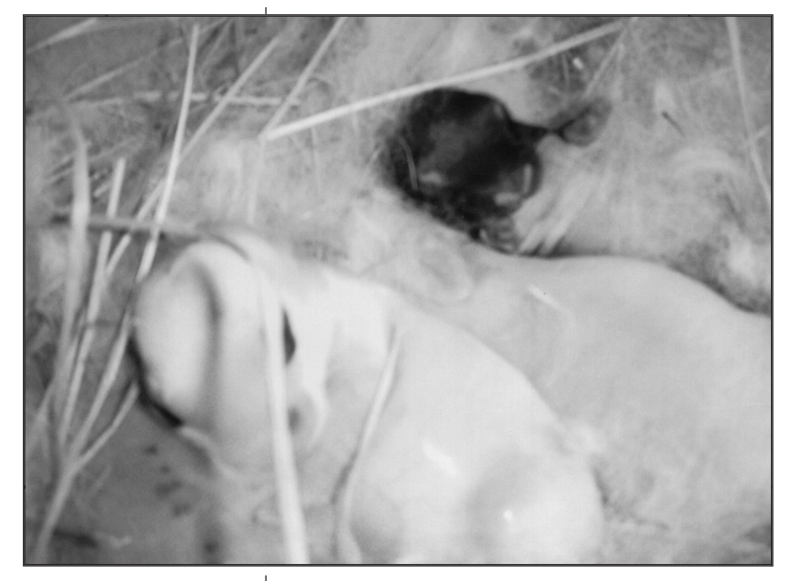
Three-day-old babies in the nest made of mom's fur and hay. Mom is not always present.